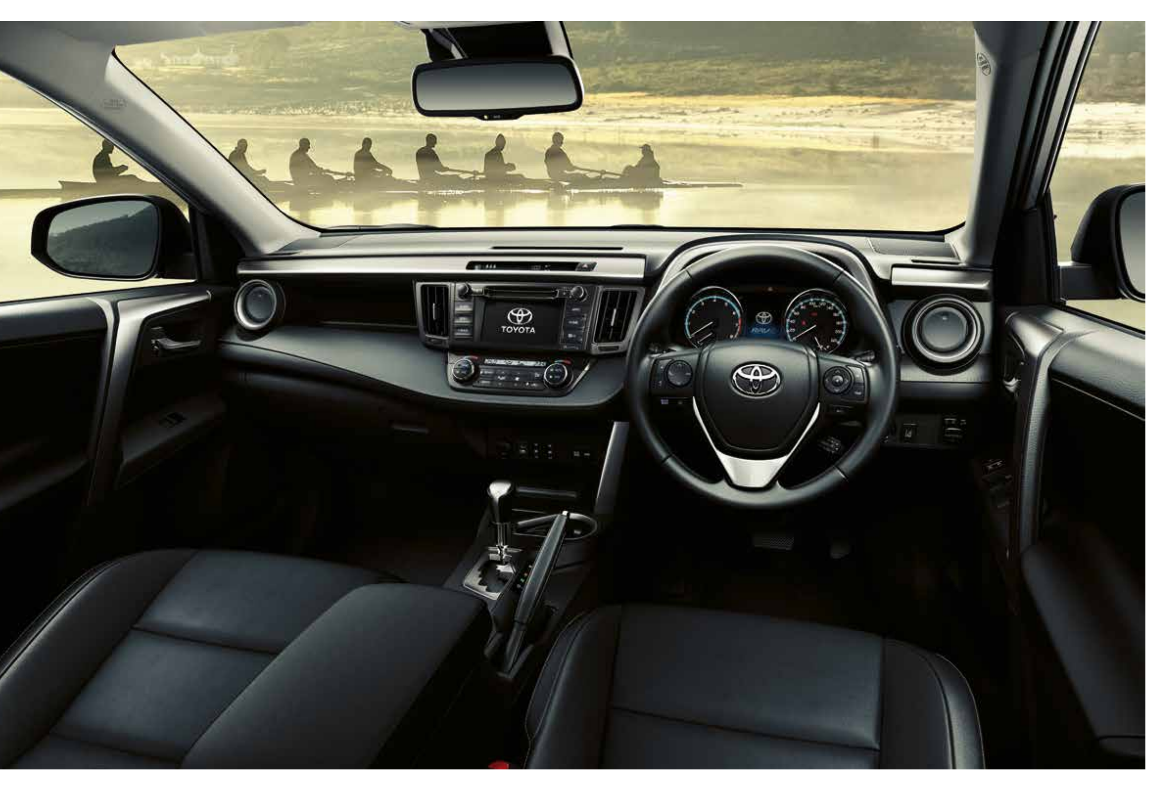
MODEL SHOWN RAV4 2.5 VX AT AWD

Seating fabric and design is also premium: in the GX models, a distinctive high-quality fabric has been used, while the VX has a luxurious leather trim in a choice of beige or black.